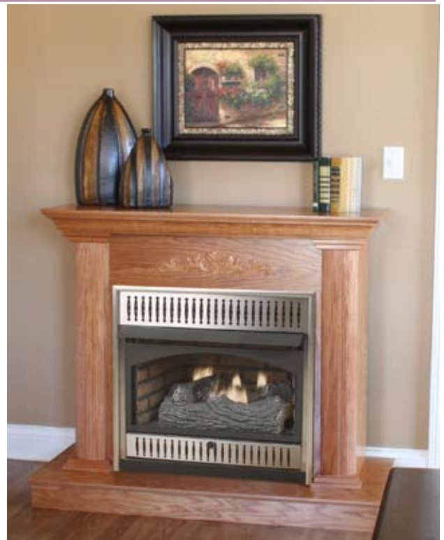
Dual Burner Compact Fireplace System shown with oak cabinet mantel. (VDCF)