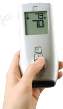
ProFlame "Smart" Remote.