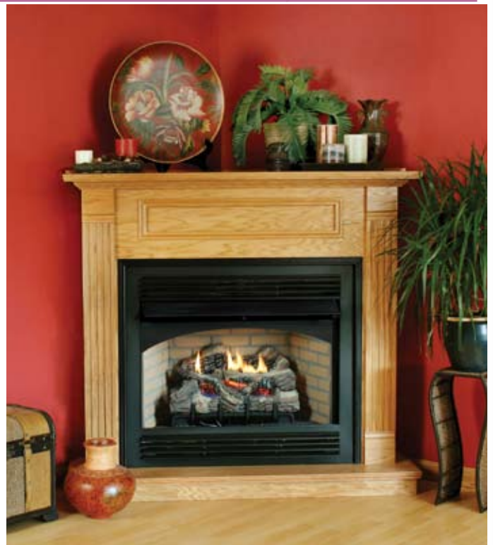
The Classic Pro offers the ultimate in convenience, and includes the ProFlame remote control. (VSGF36)