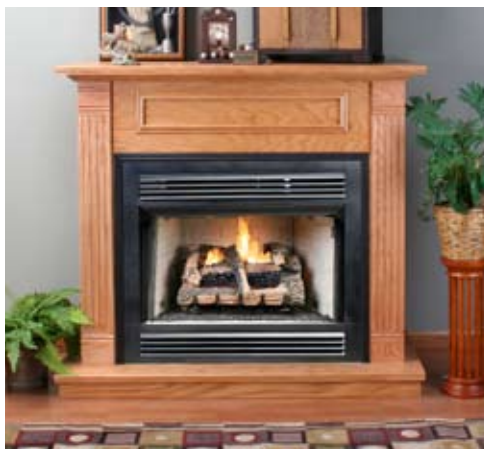
The 36" Classic Hearth (VL36LE) features concealed manual controls with gas log set, a white refractory liner and rolled louvers.

VSGF28 models are thermostatically controlled and equipped with an automatic variable speed blower. Thermostatically controlled models offer 28,000 Btu, enough to heat up to 1,000 square feet.