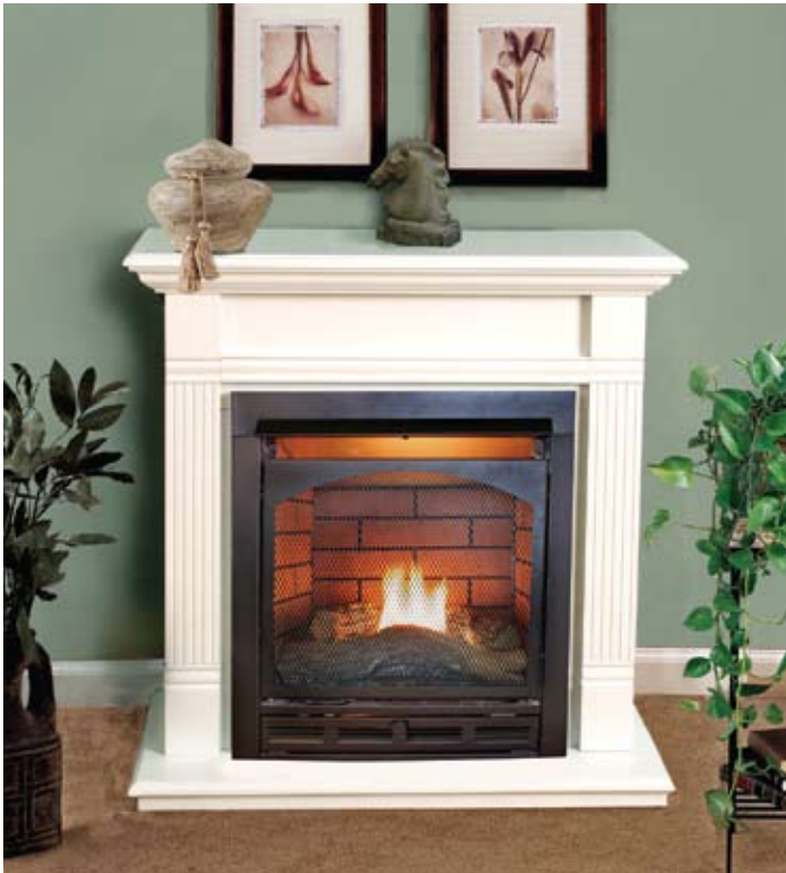
The Mini Classic is a small, bedroom-approved fireplace. Cabinet mantels are available in wall or corner mantels.