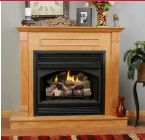
The 32" Classic Hearth (VSGF33) features 24" Blaze n' Glow logs that provide a vibrant glow with brilliant yellow flames.