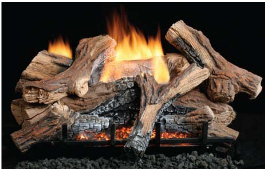
24" Scarlet Oak

Pair a LogMate with any of these attractive Vanguard Vent-Free Gas Log Heaters.