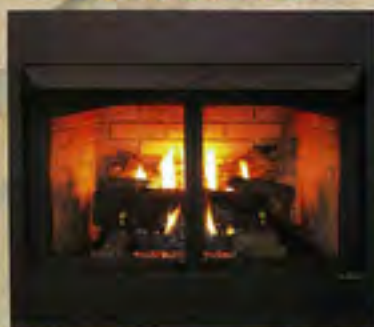
Shown with Optional Log Set (ZCBBXL)