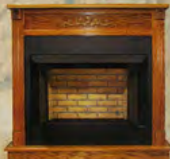
Shown with Deluxe Mantel

Our Model ZCBB is available as a 36" or 42" zero clearance universal firebox. Install it almost anywhere since no chimney or hearth is required. Customize for the look you want with tile, rock or marble and add a raised hearth if you desire. The ZCBB offers an efficient heat circulating design which keeps warm air flowing. This fireplace is perfectly completed by adding a set of Buck Stove Vent-Free Ember Vision Gas Logs.