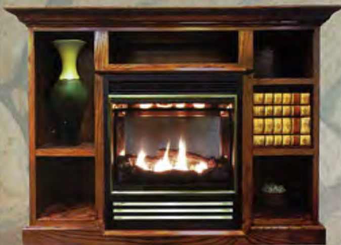
1127 shown above in optional Prestige bookcase mantel.

These units prove that good things come in small packages. For just pennies per hour you can enjoy up to 10,000 BTU's (Model 1110) or up to 25,000 BTU's (Model 1127) of heat circulating throughout your home by the factory installed variable speed blower system. The model 1110 is approved for bedroom use (check local codes) and is identical in size and shape to the model 1127. Both models share the same great options and both models are wall mountable.