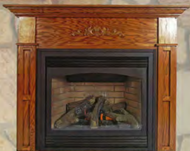
Shown With Optional Flush Mount Mantel

Our industry leading flexible vent pipe (shown above) allows for more simplified installations. Typically, installation with a standard DV pipe requires multiple elbows, fittings and connections. These are eliminated by using this expandable flexible pipe.