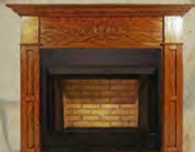
Shown with Flush Mount Mantel