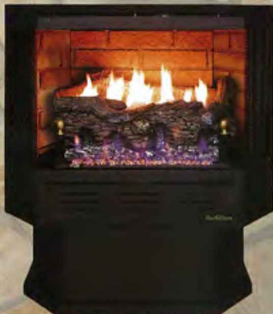
Shown As Freestanding With Pedestal

*Size, Color, Style and Options on units and mantels are subject to change without notice.