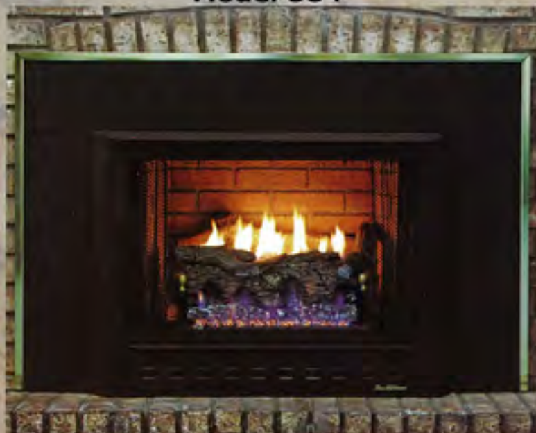
Shown As Fireplace Insert With Trim Kit