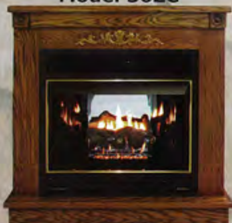
Shown With Optional Finished Mantel