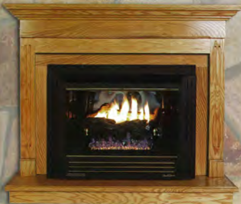
Shown With Brass Accents In Contemporary Mantel With Light Finish (Also Available In Dark Finish)

The Model 34 ZC is our most popular vent-free Fireplace providing up to 33,000 BTU's of clean heat. Standard features include factory installed variable speed blower and thermostatically controlled gas which modulates to maintain desired heat output. Optional Millivolt gas valve for use with remote control or wall thermostat. Choose from numerous installation options to fit every need. Model 34ZC can be used as a masonry fireplace insert, freestanding with optional mantel or this unit can be built into existing wall for zero clearance application.