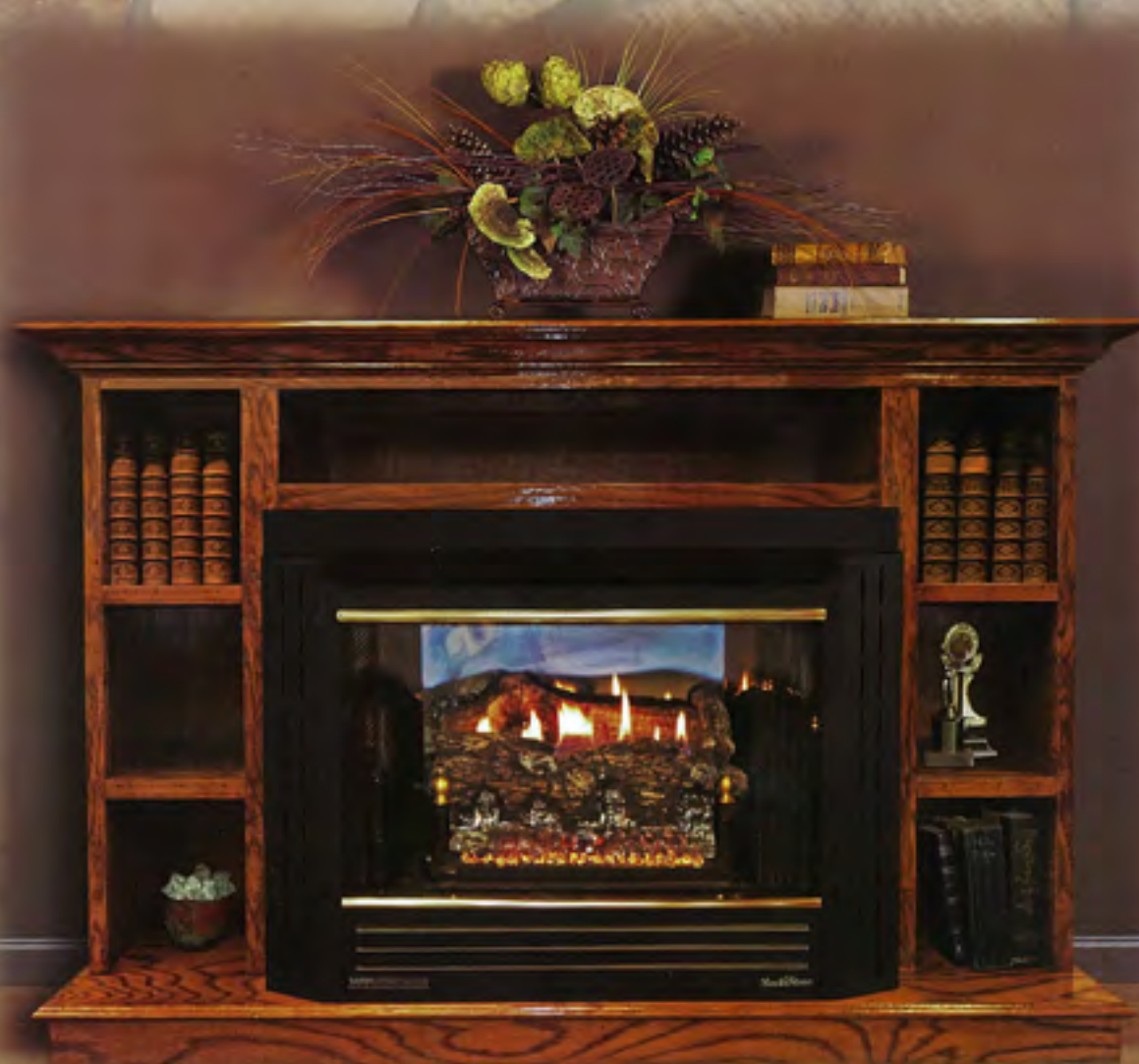
Model 34ZC in Prestige Bookcase Mantel