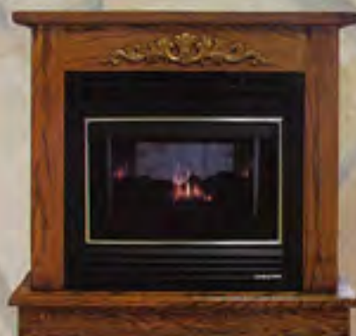
Shown With Optional Deluxe Mantel