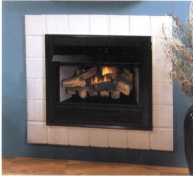
The Vanguard Vent-Free Gas Fireplace Insert simply slides into an existing masonry fireplace or recesses into a frame opening. Refer to owner's installation manual for zero-clearance application. (Minimum Fireplace Opening 26" H x 34 3/4" W x 15 3/4" D)

A Vanguard Vent-Free Gas Fireplace Insert is an ideal way to turn an unsightly, sooted or damaged wood burning masonry fireplace into a beautiful, 99.9% heating efficient vent-free appliance. Simply slide into an existing fireplace or recess into a wall, hook to gas, and presto! – you will have a beautiful, efficient gas fireplace. The vent-free design requires no chimney and offers safe, reliable heat for pennies an hour.