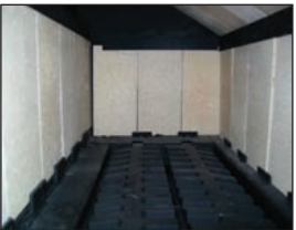
Deep, 24-1/2" Fully Brick Lined Firebox & Cast Iron Shaker Grates!