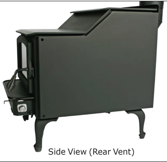
Side View (Rear Vent)