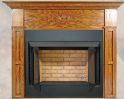
Shown with Flush Mount Mantel