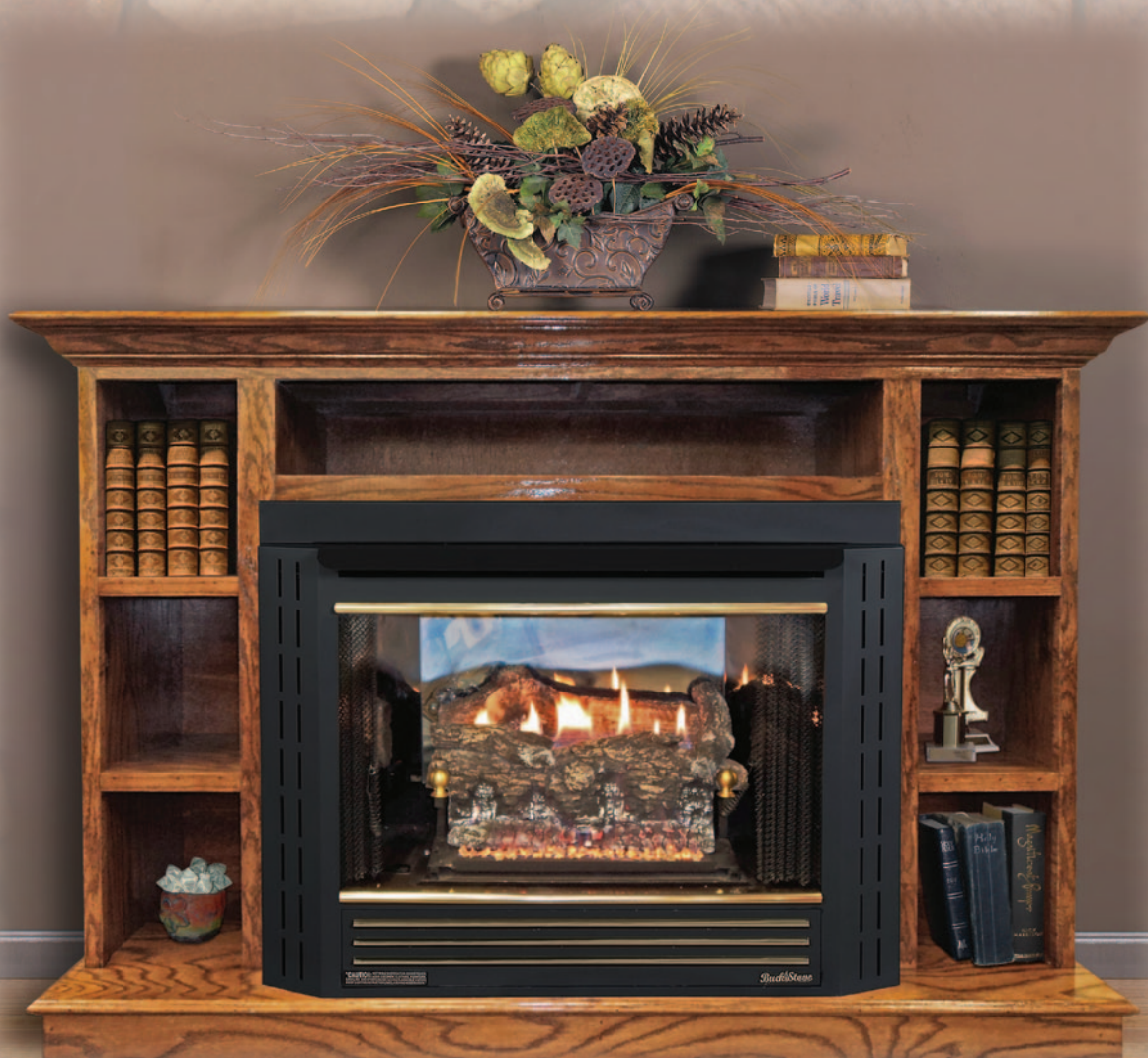
Model 34ZC in Prestige Bookcase Mantel