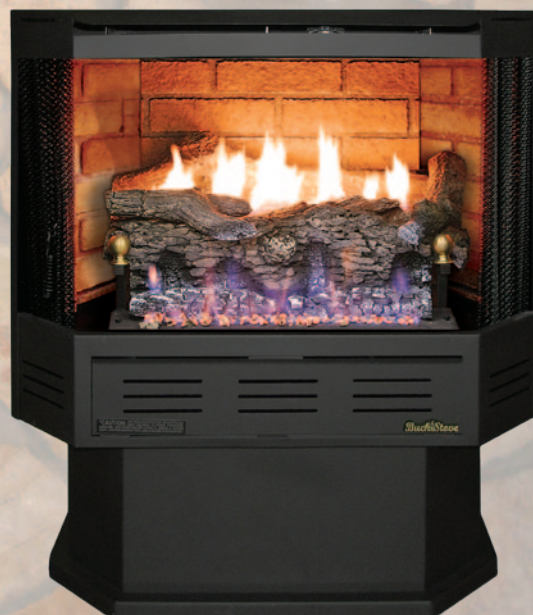
Shown As Freestanding With Pedestal

*Size, Color, Style and Options on units and mantels are subject to change without notice.