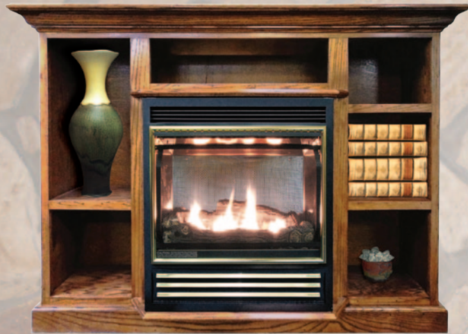
1127 shown above in optional Prestige bookcase mantel.

This unit proves that good things come in small packages. For just pennies per hour you can enjoy up to 25,000 BTU's of heat circulating throughout your home by the factory installed variable speed blower system. Wall mountable.