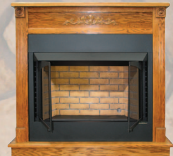
Shown with Deluxe Mantel

Our Model ZCBB is available as a 36" or 42" zero clearance universal firebox. Install it almost anywhere since no chimney or hearth is required. Customize for the look you want with tile, rock or marble and add a raised hearth if you desire. The ZCBB offers an efficient heat circulating design which keeps warm air flowing. This fireplace is perfectly completed by adding a set of Buck Stove Vent-Free Ember Vision Gas Logs.