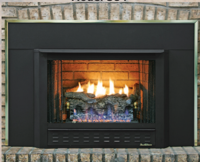
Shown As Fireplace Insert With Trim Kit

The Model 384 is the perfect gas fireplace for installation in your home. This fireplace has a new Ember Stove Base design with a glowing ember bed. The firebox area is made complete by Oak Style ceramic logs, and Boston Buff brick panels for the most realistic look available. This fireplace has a 33,000 BTU rating and factory installed blower system with built in thermostat to ensure that only warm air is circulated throughout your home. The gas control system (L.P. or Natural Gas) is a Millivolt style valve which allows you to use an optional remote control or wireless wall thermostat for extra convenience and comfort.