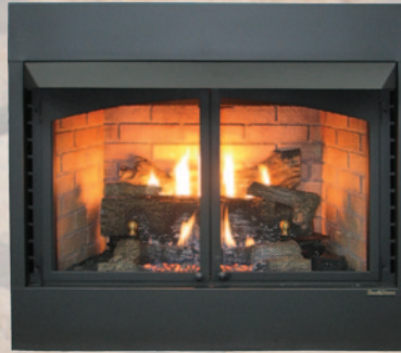
Shown with Optional Log Set (ZCBBXL)