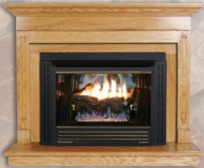
Shown With Brass Accents In Contemporary Mantel With Light Finish (Also Available In Dark Finish)

The Model 34 ZC is our most popular vent-free Fireplace providing up to 33,000 BTU's of clean heat. Standard features include factory installed variable speed blower and thermostatically controlled gas which modulates to maintain desired heat output. Optional Millivolt gas valve for use with remote control or wall thermostat. Choose from numerous installation options to fit every need. Model 34ZC can be used as a masonry fireplace insert, freestanding with optional mantel or this unit can be built into existing wall for zero clearance application.